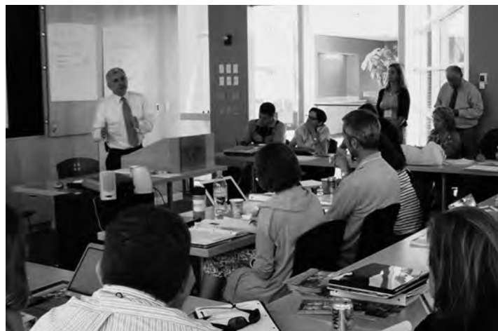
U.S. Senator Jack Reed (D-RI) speaks to high school teachers from around the United States at Brown University Choices Program's summer institute on Afghanistan.

with our curriculum units. We know that, and we hope that teachers take what is useful to them and use it with their students, whether it be the full panoply of what we provide or a small piece of an activity or reading.