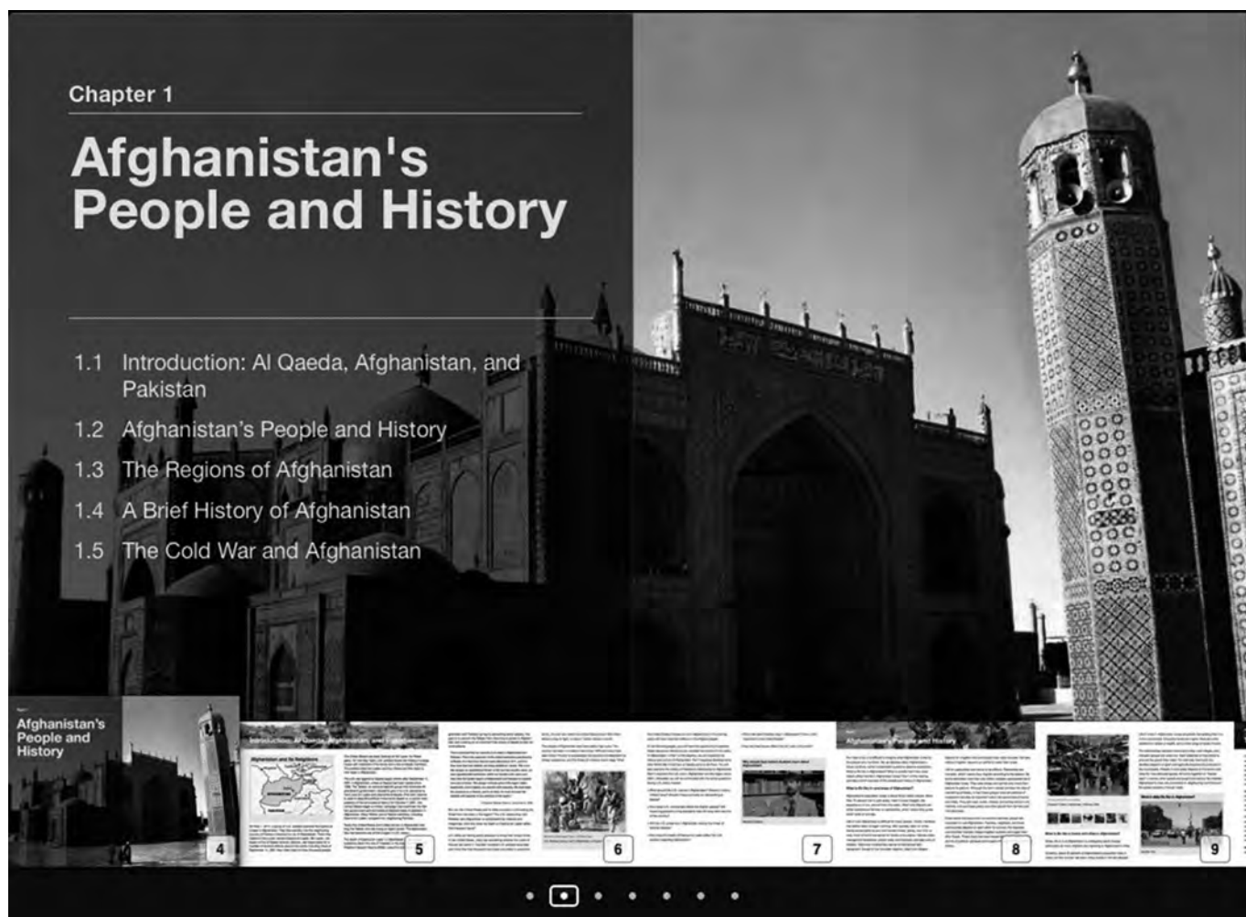
Screen capture from "Afghanistan's People and History," The United States in Afghanistan , chapter 1, Ebook edition, http://bit.ly/QK3raZ .

are making. In addition, a central activity in this unit (and all of the materials we produce) is an "Options" role-play activity. Students are asked to present and discuss four options for US policy in Afghanistan. Each of the options is laid out in detail and represents a broad strand of current thought, yet takes a different view on the following questions: