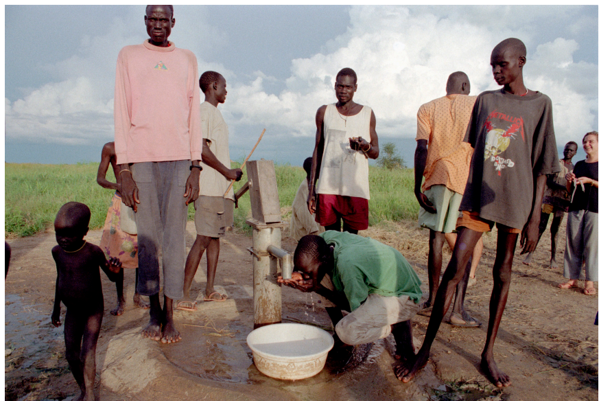
August 1998: The 2.5 million people displaced by the war in southern Sudan also faced famine. Here, these displaced people wait their turn for water.

The Islamist National Islamic Front (NIF) is a powerful political party that took over Sudan's government by coup in 1989. Led by Omar Hassan al-Bashir, the current president of Sudan, the NIF controls both the military and the oil reserves. After coming to power in 1989, President Bashir dissolved parliament and banned all political parties. Many within the international community believe that the Sudanese government pursues an aggressively Islamic agenda. In the 1990s, Uganda, Kenya, and Ethiopia, which all border Sudan, formed an alliance backed by the United States to limit the influence of the NIF outside of Sudan. In 2010, Bashir won multiparty elections, Sudan's first in more than twenty years.