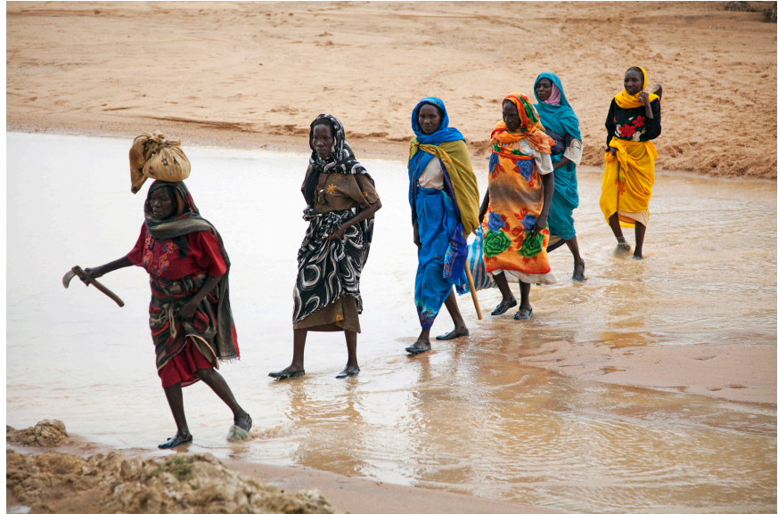
August 4, 2010: Sudanese women from Kassab Internally Displaced Persons (IDP) Camp in Kutum, Darfur, venture out to collect firewood. Female IDPs often fear being raped by rebel fighters or criminals when they leave their homes. These women were escorted by UNAMID peacekeepers.

Starting in March 2006, many in the international community began to call for a UN peacekeeping force to be sent to Darfur. Initially, Sudan's government was hostile to this suggestion, claiming that the presence of international troops would be tantamount to occupation. After months of negotiations with UN officials, the Sudanese government relented. In July 2007, the UN Security Council