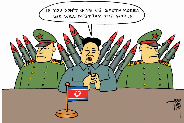
old and new N-Korean threat