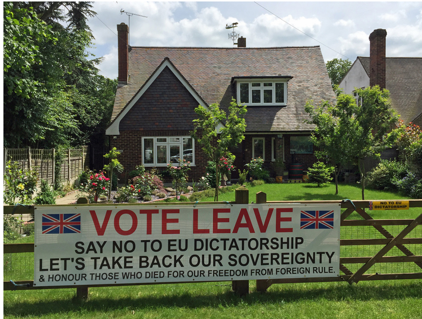
Epping, England, United Kingdom, June 2016.