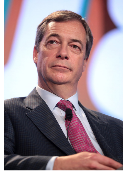
Left: UK Government [OGL v.3]. Center: UK Prime Minister [OGL v.3]. Right: Gage Skidmore [CC BY-SA 2.0].

Left: Prime Minister Theresa May (in office July 2016-July 2019). Center: Prime Minister Boris Johnson (in office July 2019-present). Right: Nigel Farage, leader of the Brexit Party.